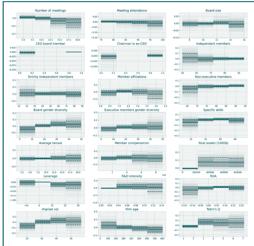
Figure 1 Mean effect for the prediction of gender equality, divided into four intervals. The dashed lines indicate 90% confidence intervals

There is a strong positive association between BGD and company gender equality. The effect on the prediction for the companies in the first interval (approximately 0%–12%) is negative and statistically significant. Furthermore, the effect in the third interval (approximately 25%–37%) is positive and also statistically significant. The positive effect for the last interval is as strong as for the third interval. However, the effect is no longer statistically significant due to wider confidence intervals. According to the results, companies with BGD of approximately 12%–25% do not have a negative or positive effect on company gender equality.