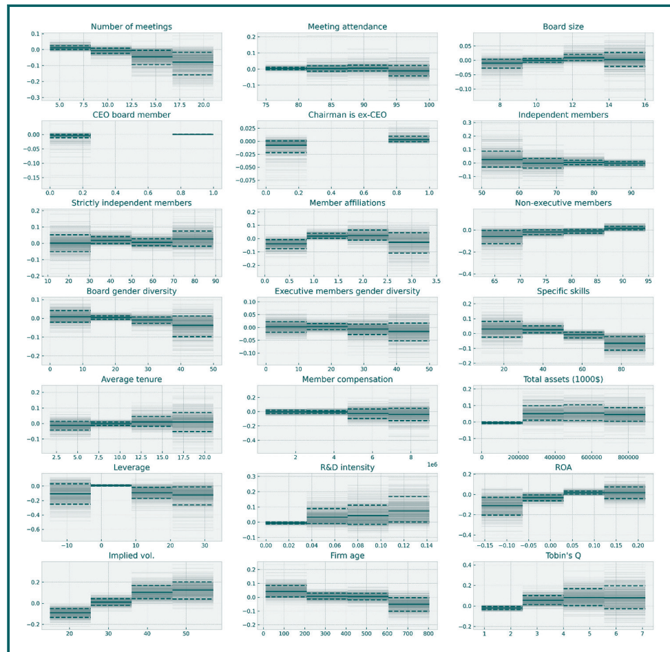
Figure 3 Mean effect for the prediction of attitude toward older colleagues, divided into four intervals. The dashed lines indicate 90% confidence intervals

performance of a company. For example, inclusive/diverse is the eighth most important predictor, right after the firm characteristics and average tenure . Moreover, the three company diversity measures are significantly more important predictors than BGD . The relative importance of inclusive/diverse is almost at the same level as firm age , which previous research has shown to have a significant impact on a company's market performance (see, for example, Frijns et al., 2016 ; Shan et al., 2017 ). The maximum effect on the prediction for these three variables is between 0.037 and 0.089.