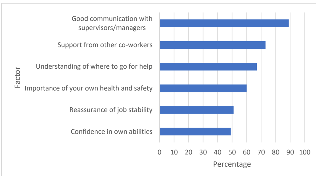
Figure 2: Factors that would encourage you to speak up about health and safety

Participants in the survey were asked how confident they would feel about speaking up about a health and safety issue on a Likert scale ranging from 1-5. The majority of respondents (63 per cent) were classified as confident as they ticked 1 “very confident” and 2. A further 20 per cent were described as neutral and 17 per cent were described as not being confident. When asked who they would feel confident to talk to about health and safety issues, 81 per cent said their boss/manager, 81 per cent their co-workers, 62 per cent friends and family, 59 per cent their supervisor, 35 per cent their head of department and 28 per cent their health and safety advisor; only one participant reported no one. Participants were then asked what factors would encourage them to speak up about workplace health and safety issues, the results are presented in Figure 2.