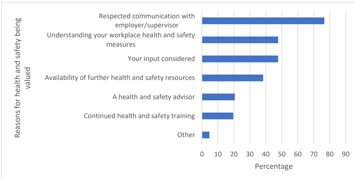
Figure 1: Why participants felt health and safety was valued by their employer